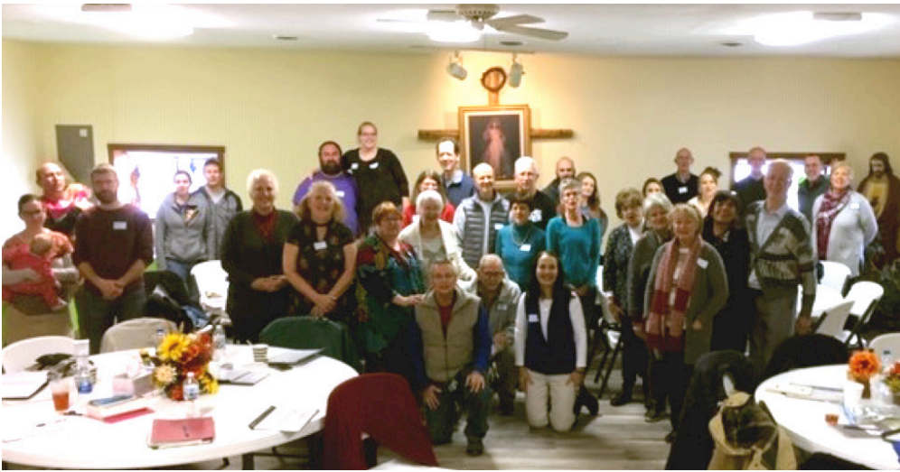
Participants of the 2019 Married Couples' Retreat ranged from newlyweds to devoted couples married up to 50+ years