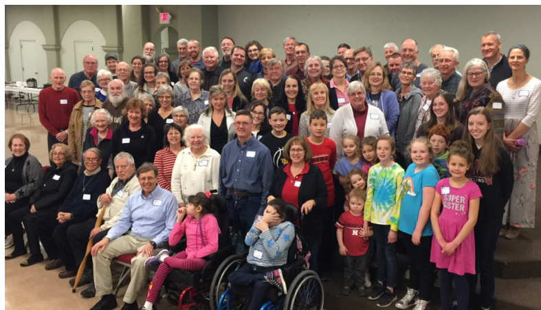
January 2020 Annual Co-Worker & Home Based Communities members Retreat in Cincinnati, Ohio