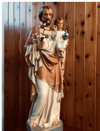
The damaged statue of St. Joseph holding baby Jesus was restored and now holds a prominent place on the left side of the altar.