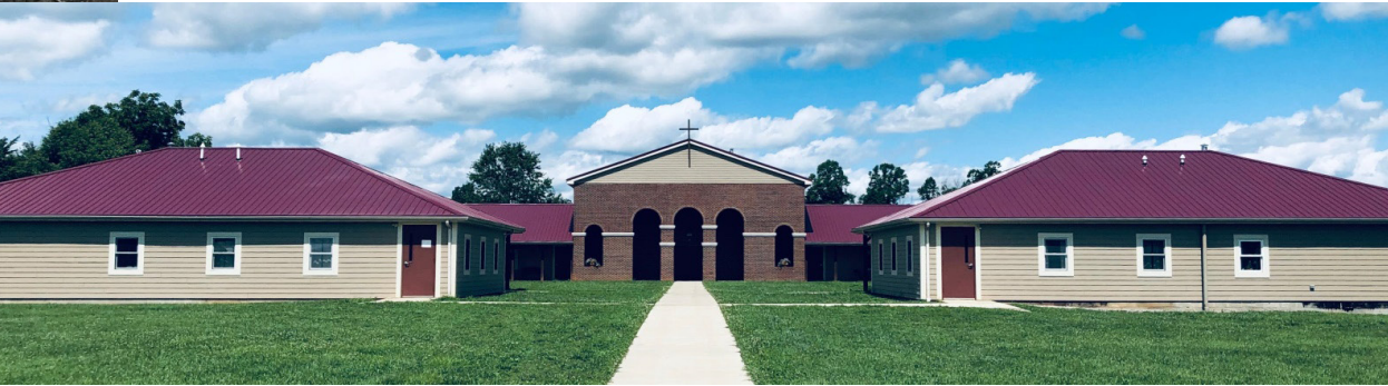
Pictured above is one of God’s many “miracles”. After 15 years of sacrificial generosity and hard work, Jesus is present (par excellence) in the Blessed Sacrament and the Holy Word of God is proclaimed in PM’s beautiful Our Lady of Guadalupe Chapel and Discipleship Center which stands in what was formerly a large cornfield.