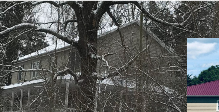
The Matson House situated on eight acres was recently acquired to provide more community houseing.